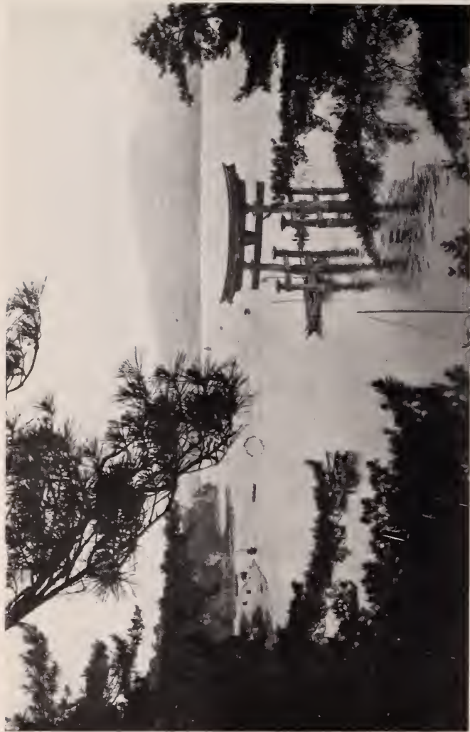
Miyajima Island, which was originally a shrine and where at one time births and deaths were forbidden